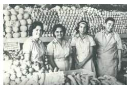
TOPLINE FRUIT EAST LINDFIELD Shop 7 Hughes Place East Lindfield